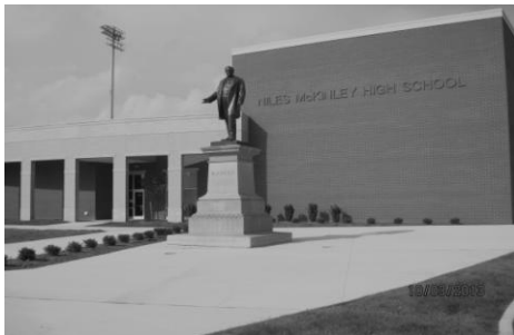
Niles McKinley High School 2013